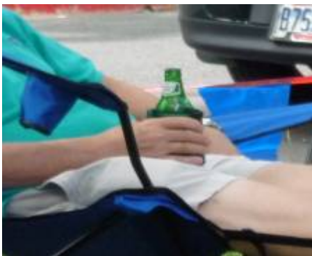
That doesn't look like a soft drink to me!