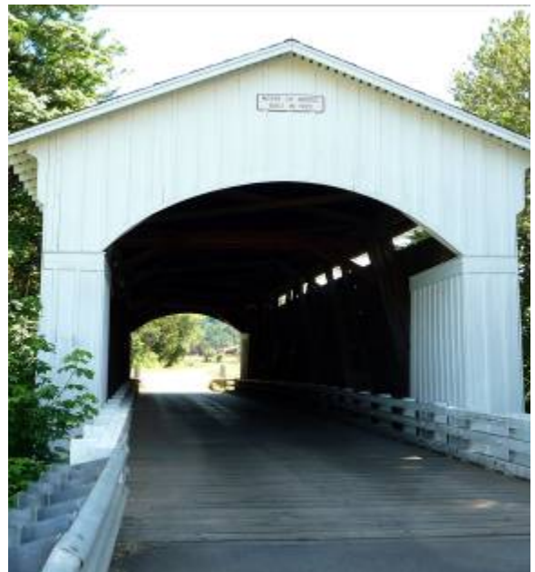
One of several covered bridges in Oregon

All items include your choice of fountain drinks, coffee or tea, a trip to the salad bar, a classic Caesar salad, or wild rice and mushroom soup as well as a choice of baked potato, mashed potatoes, lemon rice, steak fries or creamed spinach and a selection of dessert from our tray