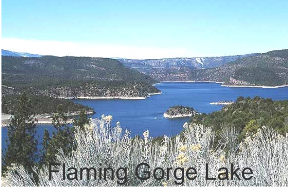
Flaming Gorge Lake