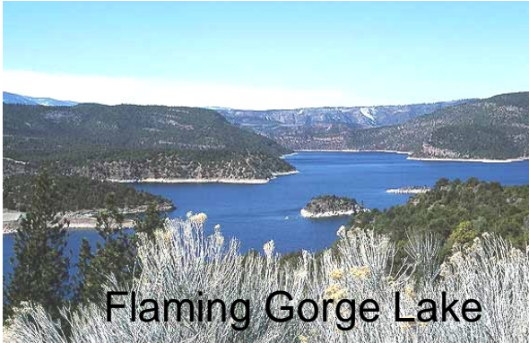
Flaming Gorge Lake