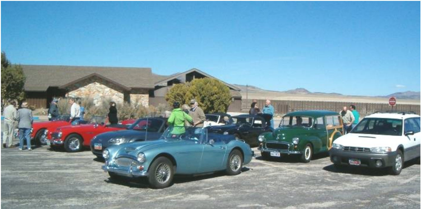
BAHC Gathering at Golden Spike National Historic Site

Flaming Gorge Trip May 19-20, 2007 See Page 3 for details